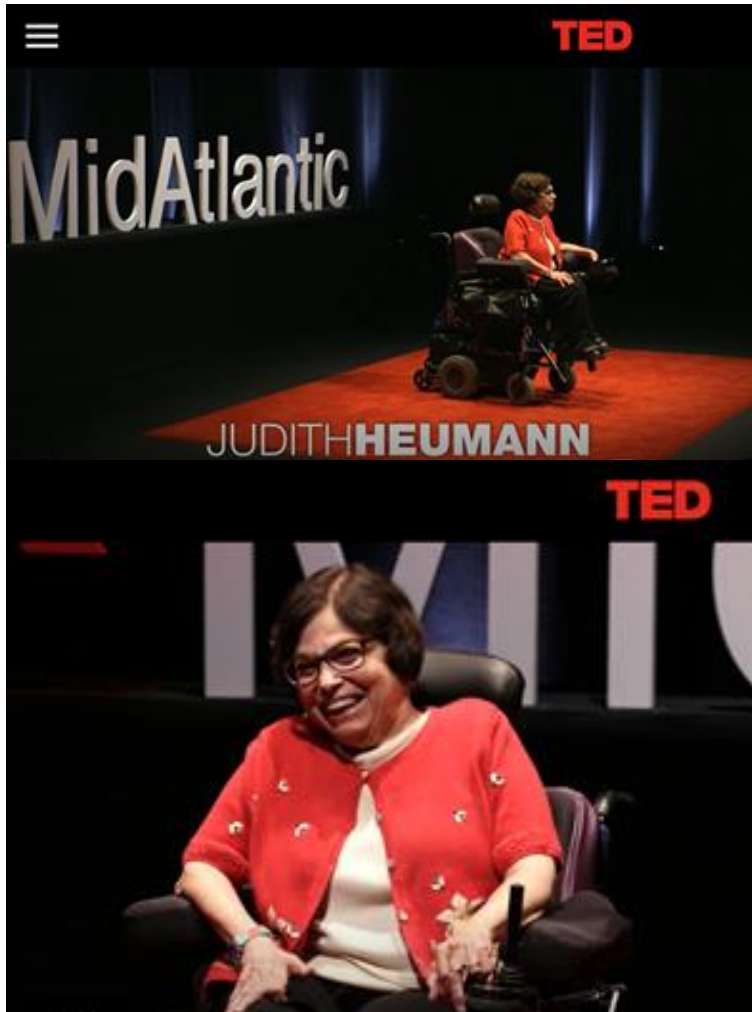
Disability rights activist and one of the author's favorite TED presenters, Judith Heumann, at TEDx Midatlantic, October 2016..